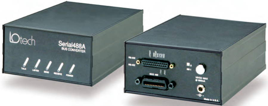
The Serial488A transparently converts between serial and IEEE devices

Connector: Standard IEEE 488 connector with metric studs