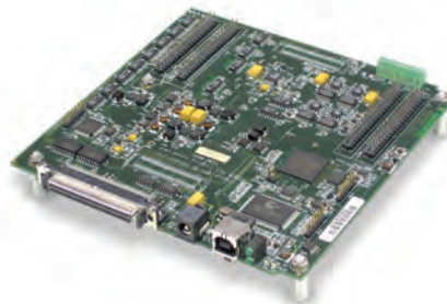
DaqBoard/3000USB, 16-bit/1-MHz USB data acquisition board