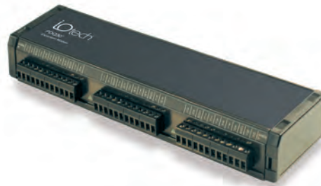
PDQ30, analog input expansion module