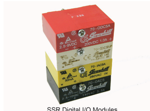
SSR Digital I/O Modules

Specifications for the SSR modules available for Measurement Computing products are listed below.